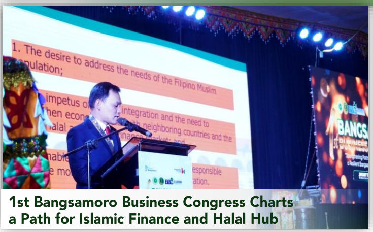
1st Bangsamoro Business Congress Charts a Path for Islamic Finance and Halal Hub

The two-day training witnessed the participation of 36 key personnel from various ministries and offices, each eager to deepen their understanding of Islamic Finance. Facilitated by the international advisory firm, Islamic Finance Advisory and Assurance Services (IFAAS), the course covered fundamental principles and concepts, including commercial contracts, Shari'ah governance, Islamic banking products, Islamic capital markets, takaful, and the Islamic Finance policy framework. Ministries and offices ranging from the Office of the Chief Minister to the Cooperative and Social Enterprise Authority - BARMM actively engaged in the training, marking a collaborative effort toward enhancing financial frameworks within the region.